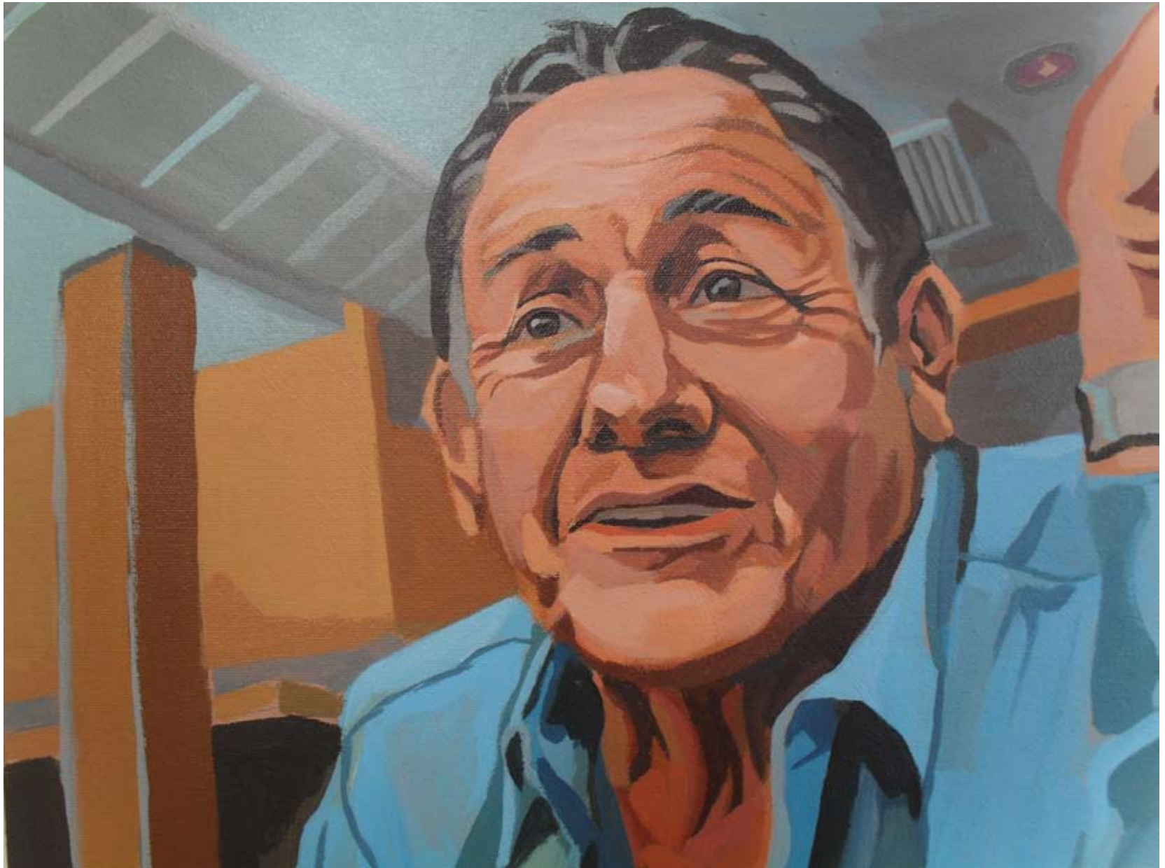
Manuel Explains acrylic on canvas 12" x 16" 2009