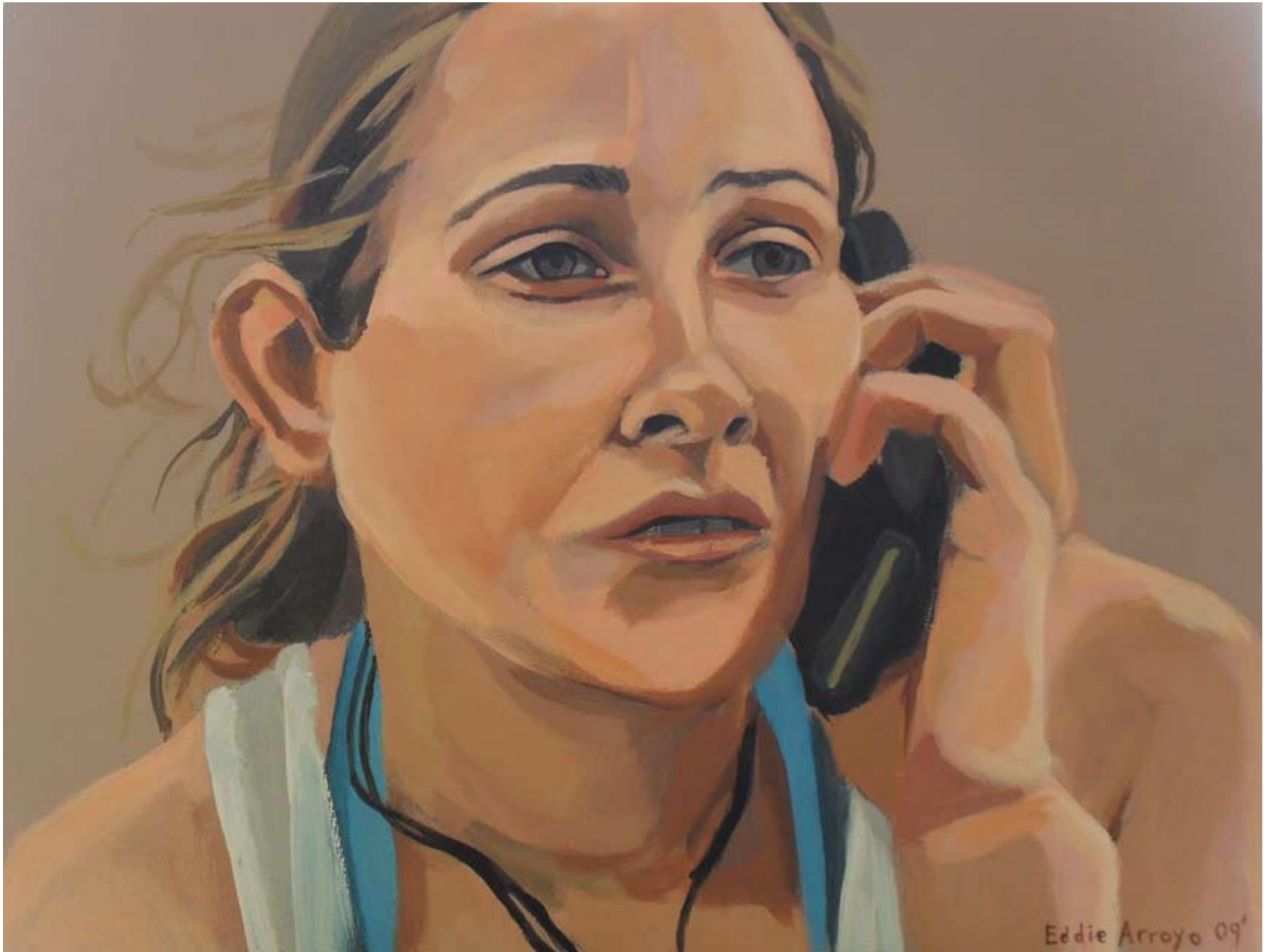
Natasha acrylic on wood 9" x 12" 2009