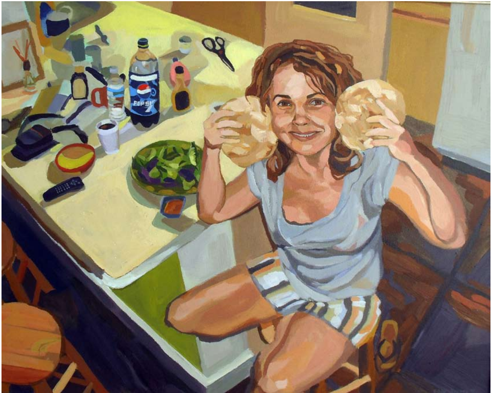
pita bread Mandy acrylic on canvas 24" x 36" 2010