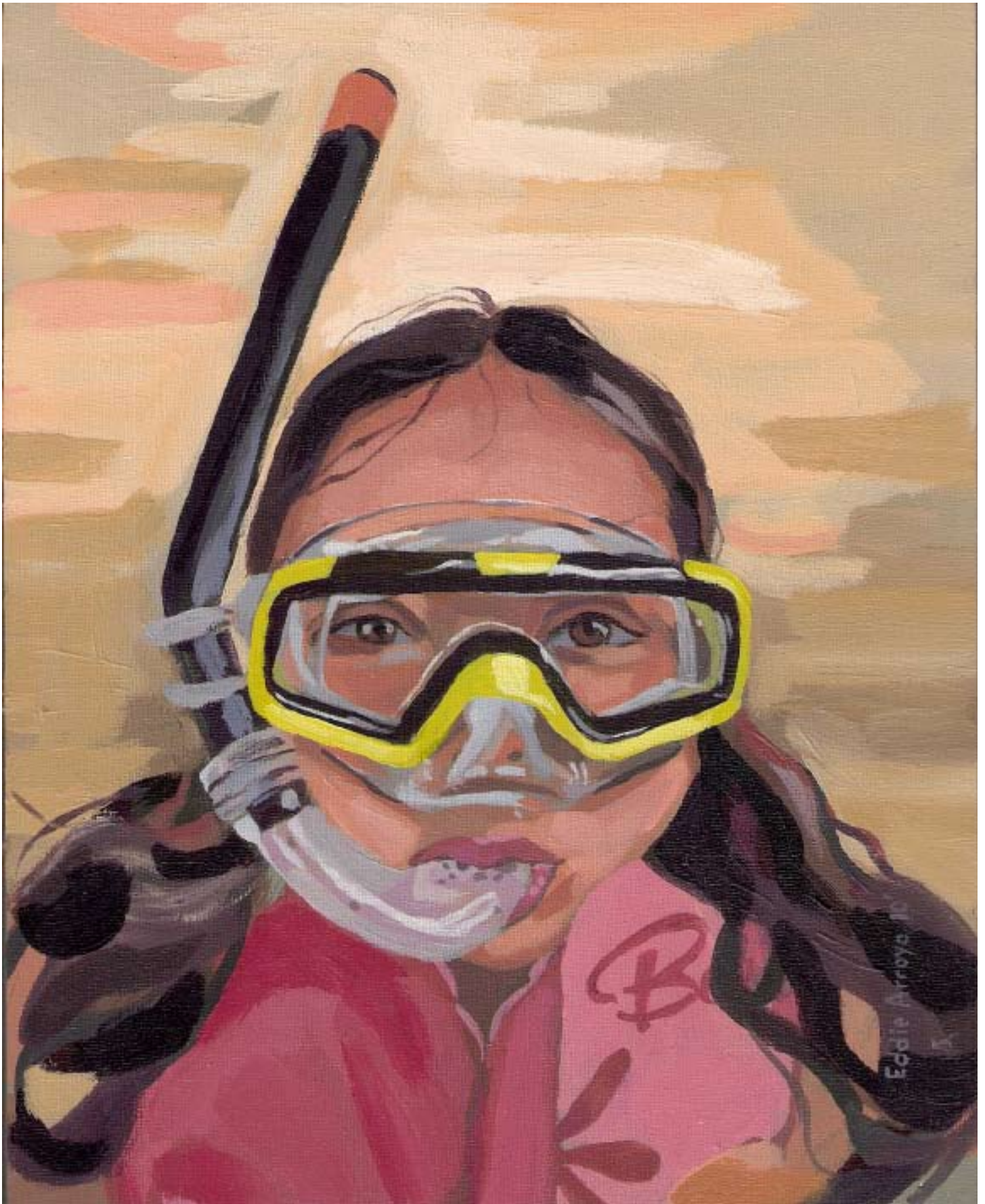
Amber with Goggles acrylic on wood panel 8" x 10" 2010