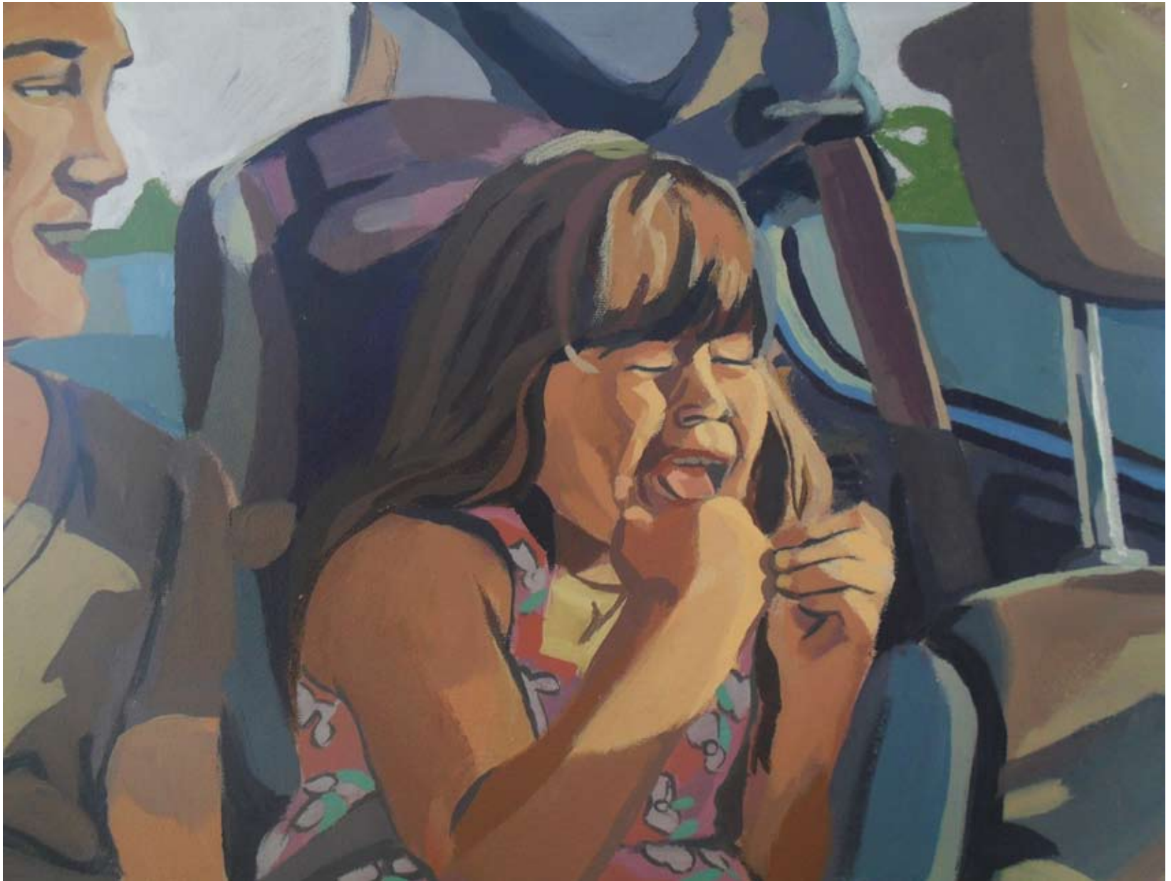
Madison's Fit acrylic on canvas 12" x 16" 2009