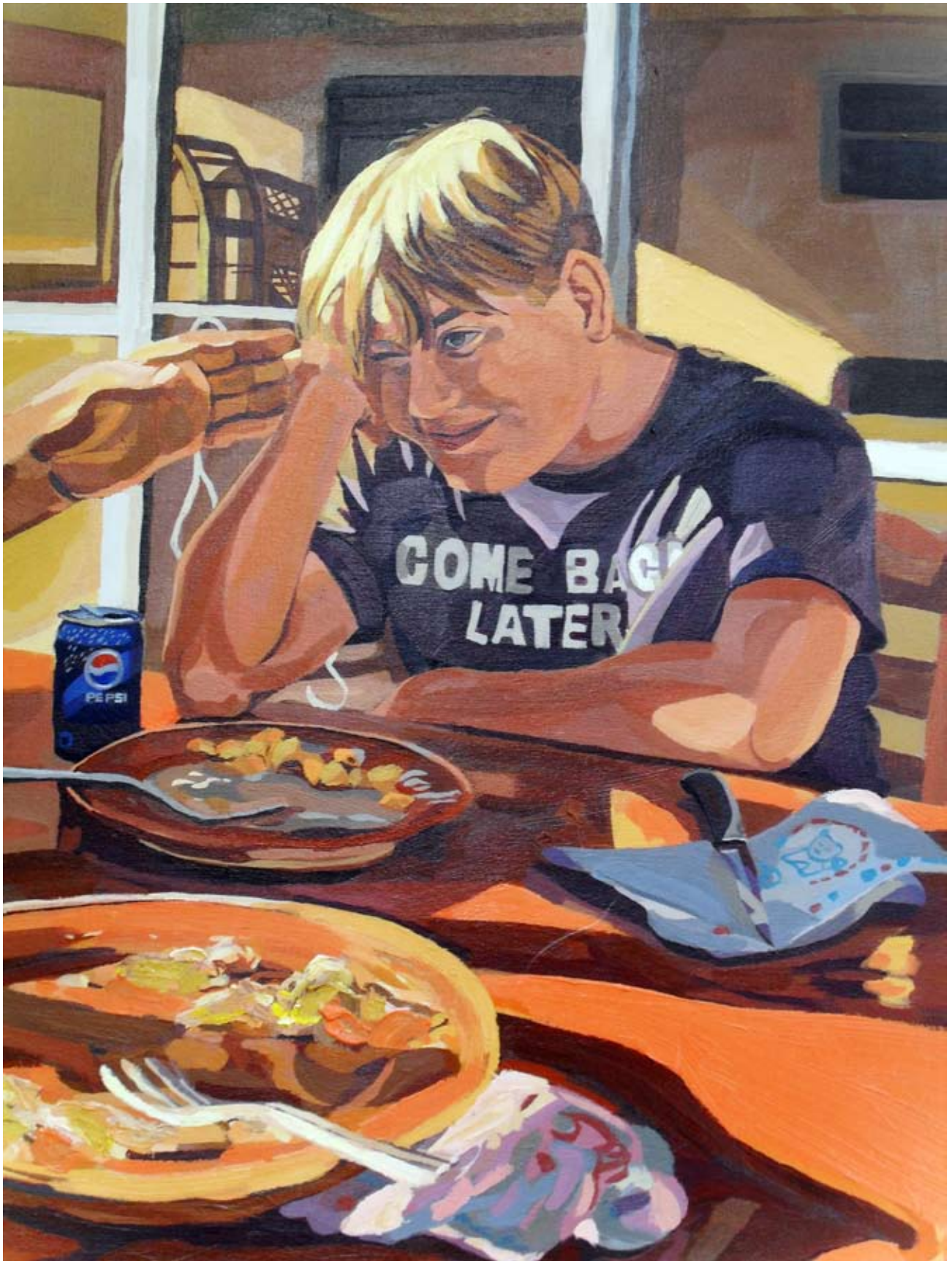
Come back later acrylic on canvas 18" x 24" 2010