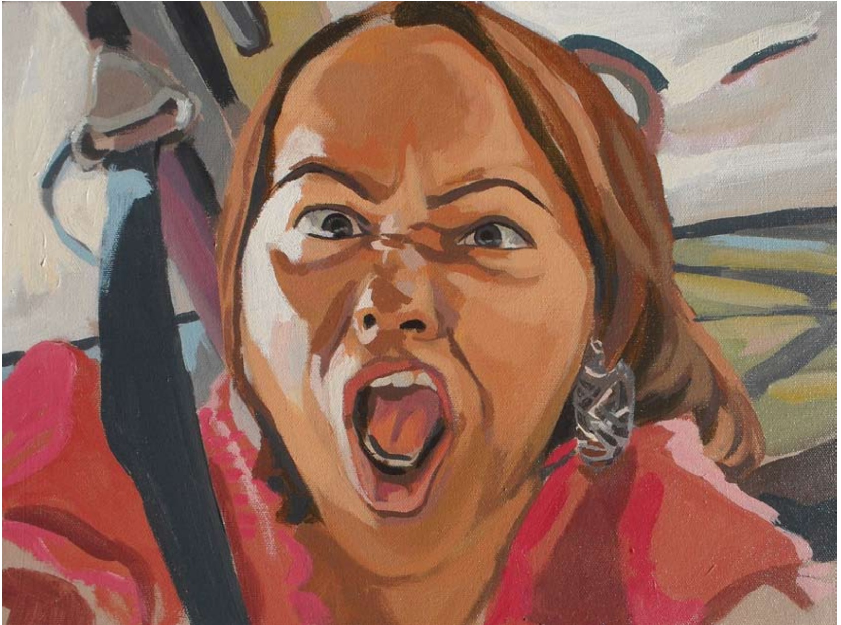
Cristina Making Faces 1 acrylic on canvas 12" x 16" 2009